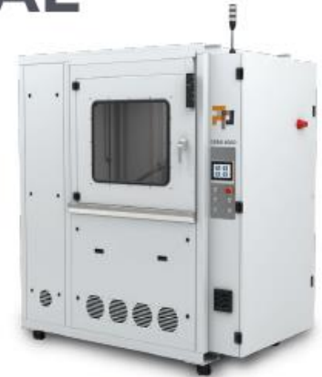
DEMI 4000 Series

Envelope: 35" L x 35" W x 25" H 89 cm x 89 cm x 63.5 cm