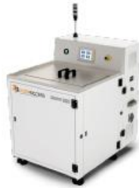
DEMI 800 Series

Footprint: 29" L x 36" W x 43" H 74 cm x 91 cm x 109 cm