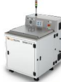
DEMI 900 Series

Envelope: 18" L x 18" W x 18" H 46 cm x 46 cm x 46 cm