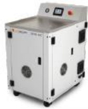
DEMI 400 Series

Envelope: 14" L x 14" W x 14" H 35.5 cm x 35.5 cm x 35.5 cm